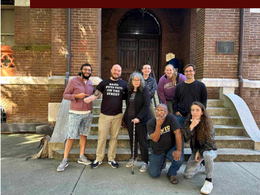
Sept. 19th, KATU stood in solidarity with neighbor at Eviction Court