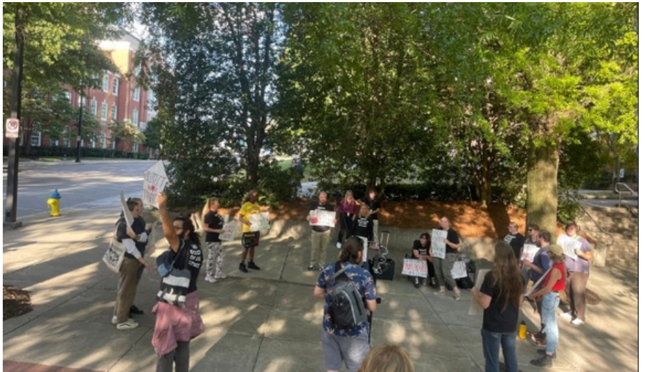
Sept. 19th, KATU announced Union at Knoxville City Council & rallies for affordable housing