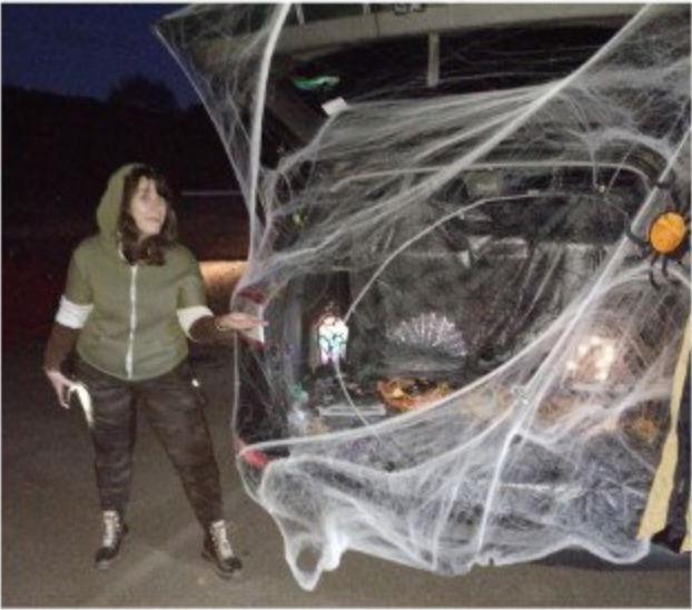
Nov. 4th Silent Auction Final & Trunk-N-Treat at Victor Ashe